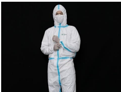
APD Microporus Supersoft Sealed Lv4