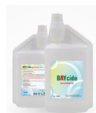
BAYcide High Level Desinfectan