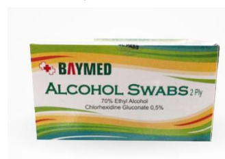
Baymed Alcohol Swab 2 Ply