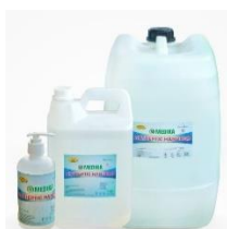
Medika Antiseptic Handrub