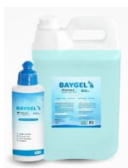
BAYGEL Ultrasound Transmission Gel