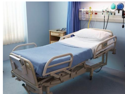
Bed Cover Set