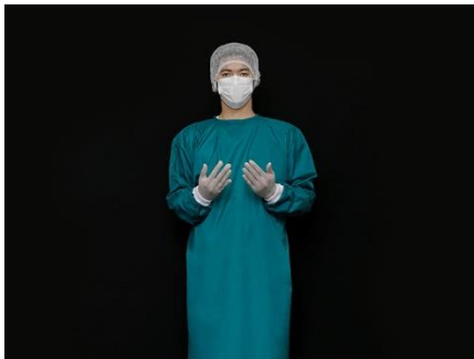
Surgical Gown SMS